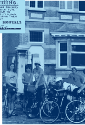
AYH bike trip

1964: President Lyndon B. Johnson recognizes "National Youth Hostels Week" on the 30th Anniversary of hostelling: