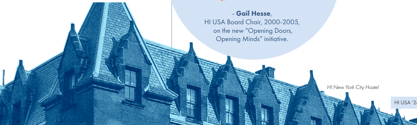
HI New York City Hostel