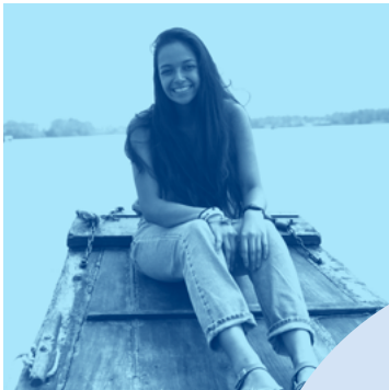
Explore the World recipient, 2021

2014: Drawing from the success of AYH’s Trips Program, Explore America and Explore the World Travel Scholarships are developed for young novice travelers who lack the means or opportunity to explore the U.S. and the world.